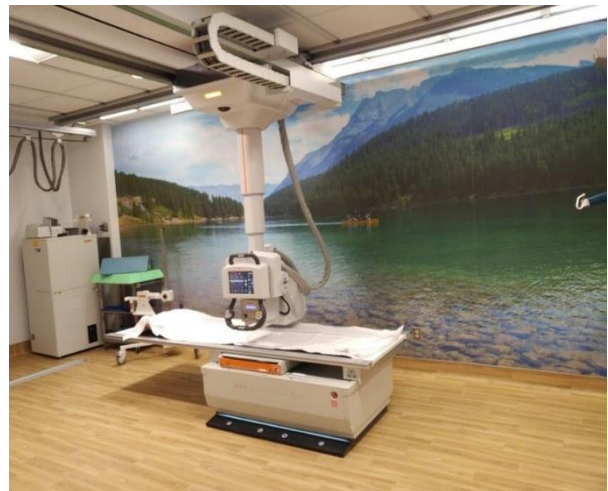
Our updated radiology suite went into service November 25.