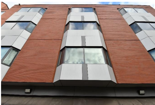
Exterior of E.W. Bickle with new brick, cladding and windows.

Exterior projects are expected to be completed this spring. Once the weather warms up, landscaping will be done as the final touch. The end result will be a building that staff, patients and families alike can be proud of.