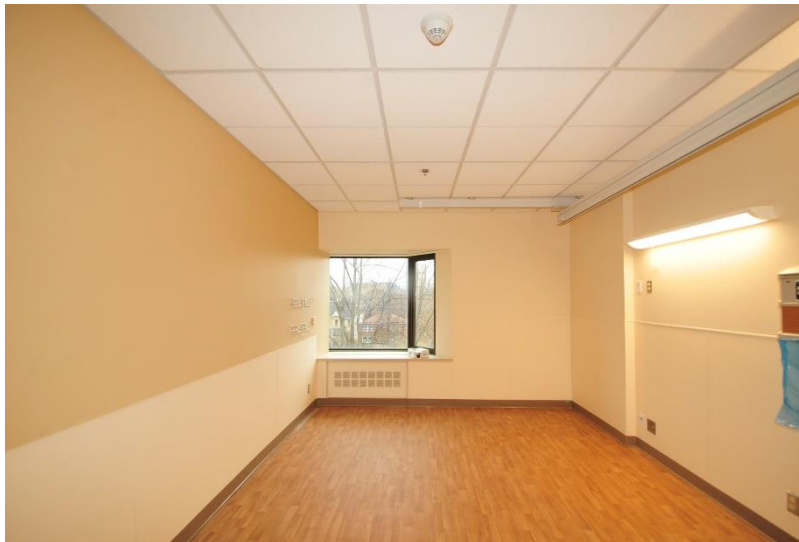
Renovated Patient Room on North 5

While common place in many hospitals today, our dated infrastructure made it impossible to install without a full renovation.