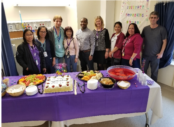
The Dialysis team on South 3 celebrate the full operations of the nocturnal dialysis unit.

It was smiles and cheers on March 19 th 2018 as the new nocturnal (night-time) dialysis unit on South 3 transitioned into full operations.