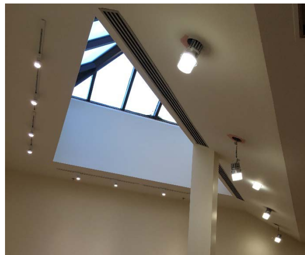
Skylights in the basement help to create a warm and bright space.

As basement areas are completed, they will be used to facilitate other renovations.