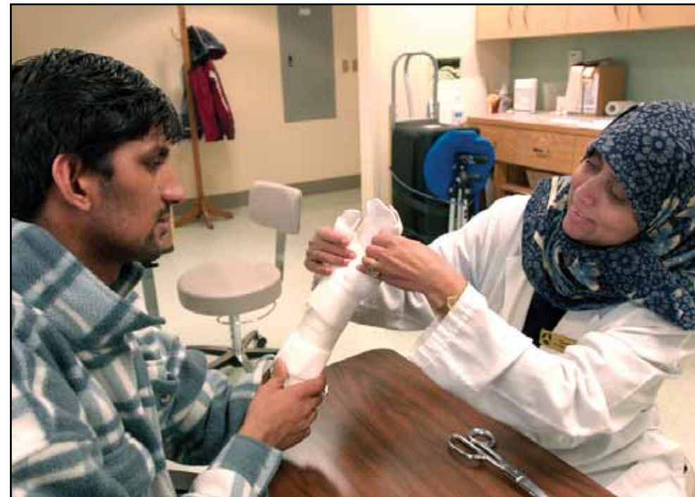
The Hand Program is a speciality within the Arthritis Program that provides care in four primary areas: traumatic hand injury, arthritis of the hand, rheumatoid arthritis and work-related injuries.