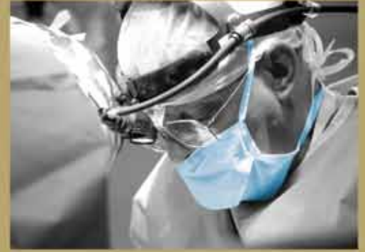
Princess Margaret Hospital