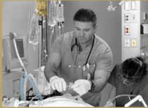
Toronto Western Hospital