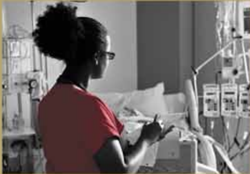
Toronto General Hospital