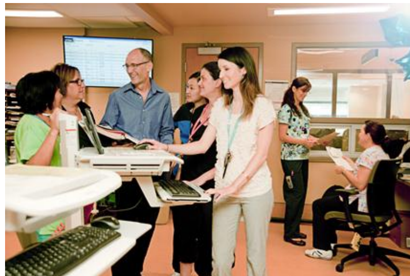
Clinical staff on the Geriatric Psychiatry Unit at Toronto Rehab.