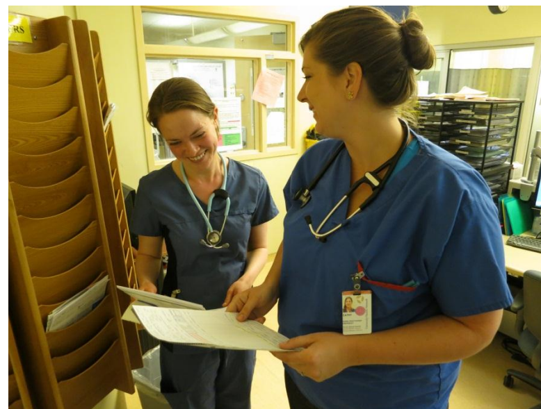
Nursing staff in the Toronto General Emergency Department.

The survey also provided the first official insight into the satisfaction of Toronto Rehab staff post-integration. On average, the Toronto Rehab scores were equivalent to the rest of UHN.